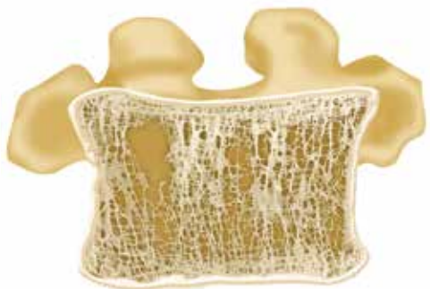
Low bone density