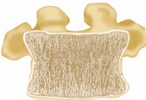
Normal bone density

Most people's bones get weaker as they get older. Whether or not a person has osteopenia or osteoporosis depends on how much of their bone density is lost.